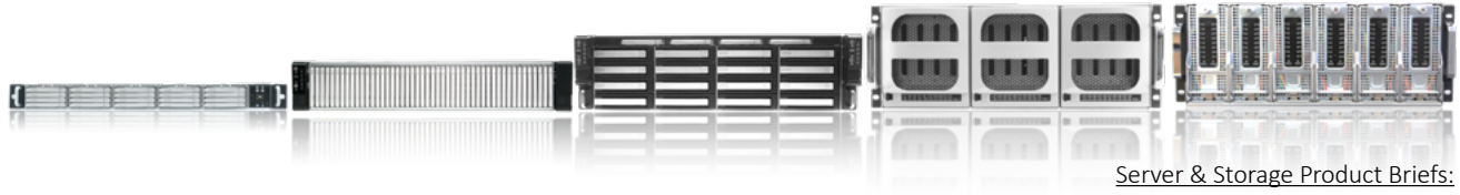
Server & Storage Product Briefs:

COMPLETE LINE OF STORAGE OPTIONS ALSO AVAILABLE :